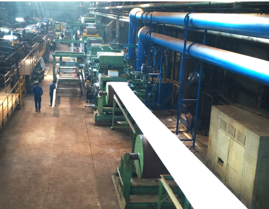
Eco dry pickling line located in Slovenia in Europe